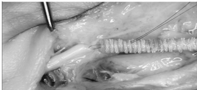
Photograph of a nerve being secured in the polyglycolic acid conduit. [fig 1, Plast Reconstr Surg 106:1036-1048]